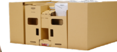
New corrugated packaging