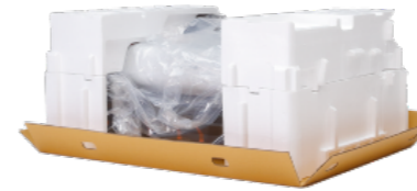
Previous polystyrene foam packaging